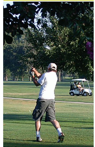
Plumas Lake Golf Course

Yuba County's Building Department customer satisfaction ranked 5th in the Sacramento Region in March 2008, according to Business Journal research. The survey is based on opinions provided by builders, architects, developers and engineers.