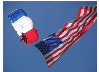
June 6-8 Yuba County Air Show

The Sleep Train Amphitheatre is open for business with the concert season beginning in May. The Yuba County Airport will host another Regional Fly-in and Air Show June 6, 7, and 8, 2008. Approximately 10,000 aviation fans showed up for last year's event, which included workshops, vendors, and three air shows.