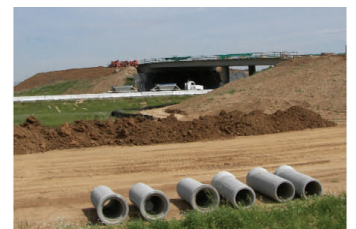
Plumas Lake Interchange nears Completion in 2008

A second interchange at Highway 70 and south Feather River Boulevard could begin construction as early as 2011.